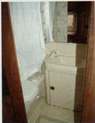
Washroom was a little dingy