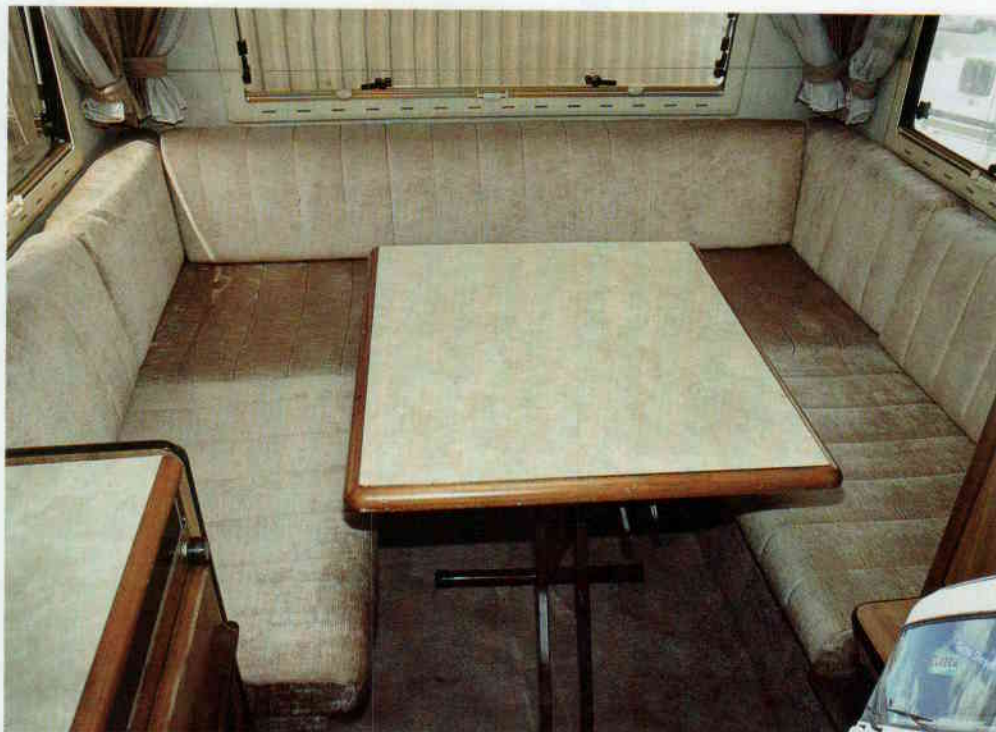
Cream soft furnishings had survived remarkably well, considering this vehicle's age