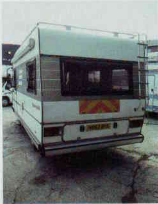
Rear hatch led to storage area

berth. Also, the table was heavy, and would need to be secured for travel.