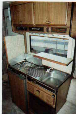
Kitchen facilities weren't particularly impressive