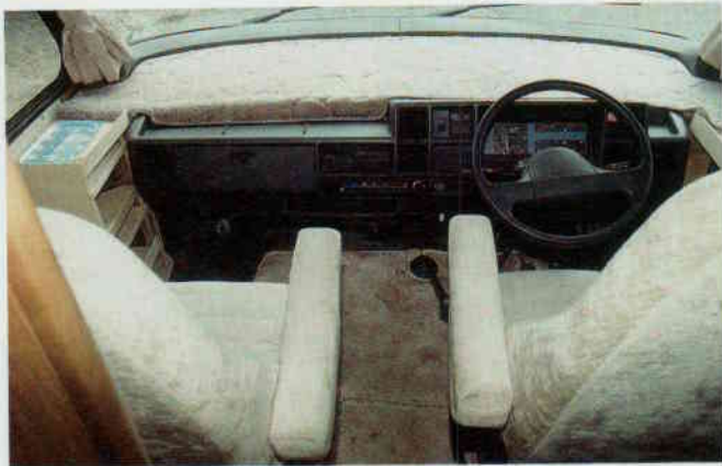
High-back captains seats make the Hymer a comfortable cruiser